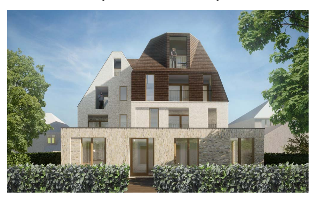
Rear elevation showing single storey rear projection

8.9 The proposed footprint of the building is larger than its neighbours. There is a single storey ground floor projection at the rear with a green roof which extends 13.8m beyond the rear of number 221 to the north but this projection is pulled away from the boundary by 3.1m, and no 221 has a less deep rear elevation than is typically found in the area. It extends 4.7m beyond the rear of number 217 to the south. Upper floors and the main mass of the building project much less (6.8m beyond the rear of number 221 and no further than the rear of number 217). The 45 degree lines from the closest ground floor habitable rooms of the neighbouring properties on either side are shown on plans. These are breached on both sides at ground floor level by the proposed single storey projection at the rear, however the single storey projection will not have an impact on the character of the area and is considered to be an appropriate design response to accommodate a flatted scheme on the site. The upper floors have been informed by the 45 degree lines from rear windows of neighbouring properties and the main bulk of the building does not breach the 45 degree lines.